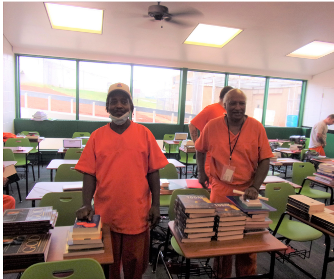
Distributing textbooks for the fall semester

Contributions supporting the Prison Divinity Program have now exceeded $625,000.