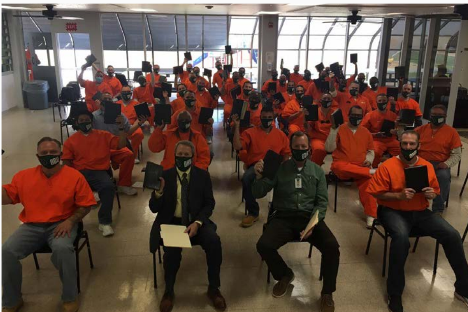
Students gather for corporate worship prior to beginning classes and hold up their new Bibles.