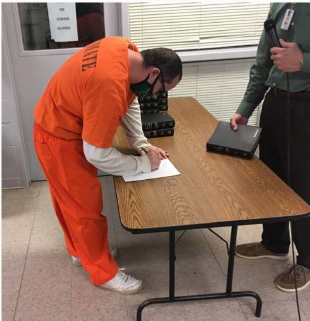
Each student came forward and signed our Covenant of Accountability and Encouragement prior to receiving his new Bible.