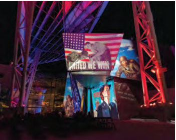
Expressions of America Experience On select departures only.

Arrive at The National WWII Museum and the Higgins Hotel New Orleans, Curio Collection by Hilton and check-in to the Higgins Hotel.