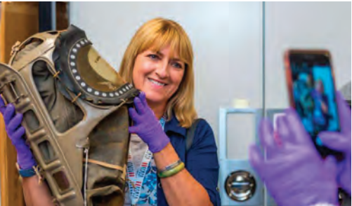
OUT OF THE VAULT MUSEUM TOUR WITH A MUSEUM CURATOR

Prominently located in the New Orleans Warehouse District and directly on the Museum campus, the Higgins Hotel & Conference Center features a striking 1940s theme and is part of the exclusive Curio Collection by Hilton. This 4-star hotel offers spacious and well- appointed accommodations, featuring 230 era-inspired guest rooms and suites, exceptional dining, and a state-of-the-art conference center, home to the Museum's many conferences, symposia, military reunions, student group visits, and student and teacher residential programs. Revenue generated by the Higgins Hotel helps fund the growth of the Museum's endowment and educational initiatives.