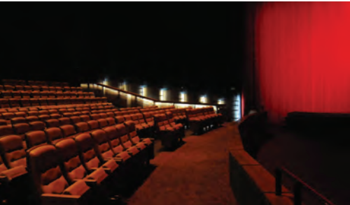
BEYOND ALL BOUNDARIES A UNIQUE CINEMA EXPERIENCE