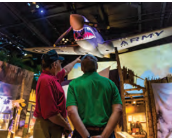
The Road to Tokyo Gallery, Campaigns of Courage