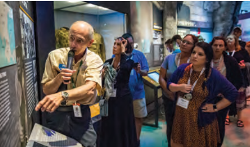
EARLY ACCESS TO CAMPAIGNS OF COURAGE GALLERIES