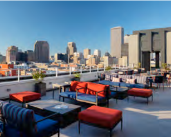
Rosie's On The Roof, Higgins Hotel