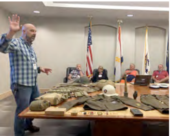
Out of the Vault Museum Experience